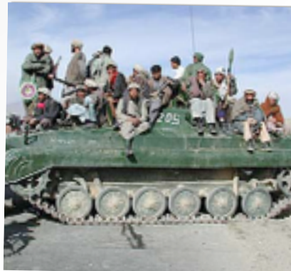
CIVIL WAR CONTINUES