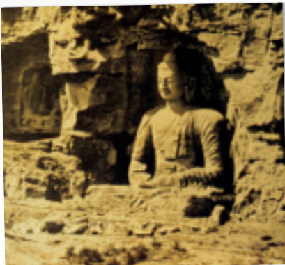
FEARS OF RELIGIOUS MINORITIES