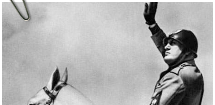
Was Benito Mussolini beneficial to Italy prior to WW2?