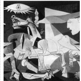
Should the USA have intervened?

Was the violence of the 1940s predestined or could good have prevailed by action in the 30s?