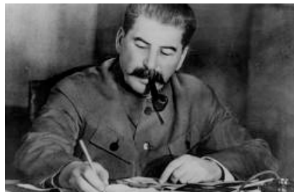
Did Stalin commit a genocide with the stroke of a pen?