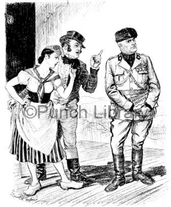
THE AWFUL WARNING.

"WE DON'T WANT YOU TO FIGHT. BUT, BY JINGO, IF YOU DO, WE SHALL PROBABLY ISSUE A JOINT MEMORANDUM SUGGESTING A MILD DISAPPROVAL OF YOU."