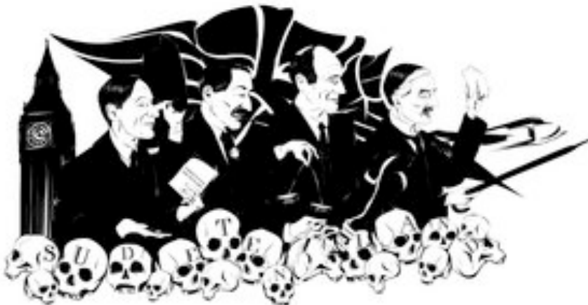
The Four Horsemen of Appeasement